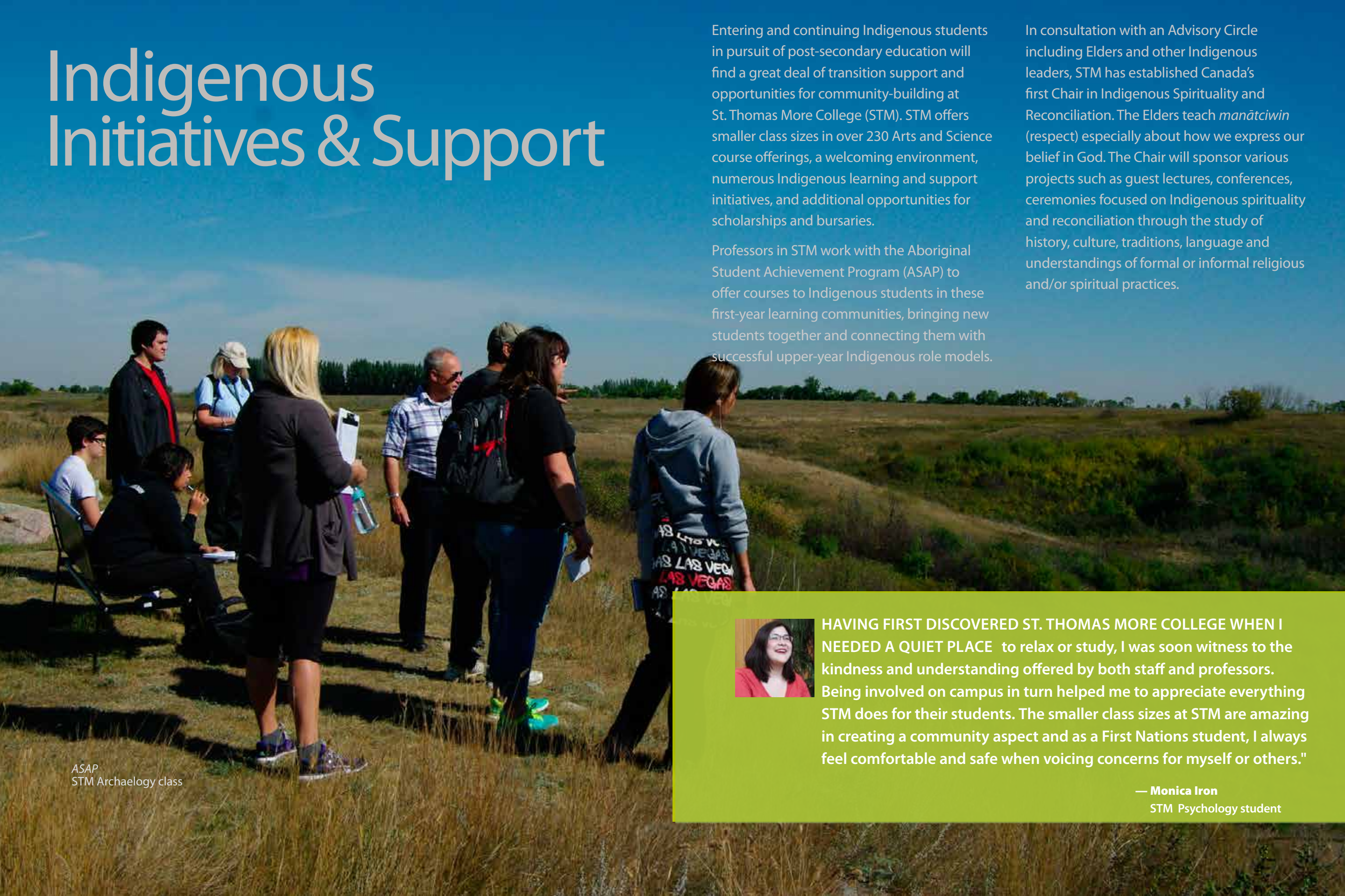
ASAP STM Archaology class

In consultation with an Advisory Circle including Elders and other Indigenous leaders, STM has established Canada's first Chair in Indigenous Spirituality and Reconciliation. The Elders teach manātcwin (respect) especially about how we express our belief in God. The Chair will sponsor various projects such as guest lectures, conferences, ceremonies focused on Indigenous spirituality and reconciliation through the study of history, culture, traditions, language and understandings of formal or informal religious and/or spiritual practices.